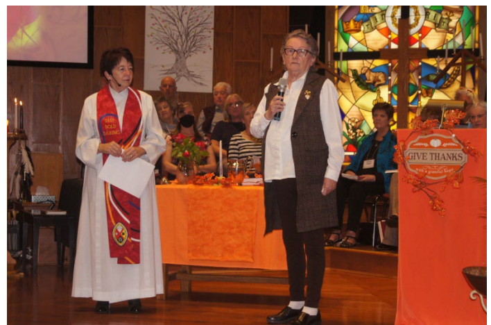
World Food Sunday