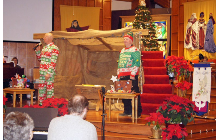
Skit Performed on Christmas Eve