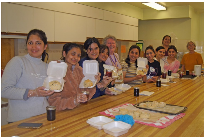
Pantry Cooking Class