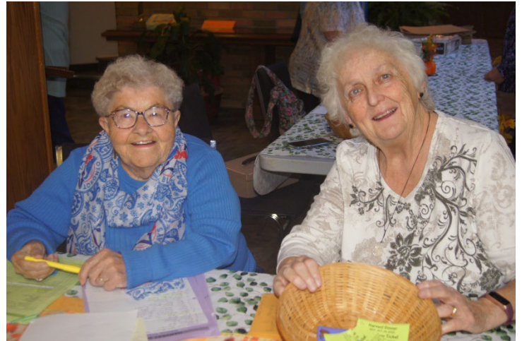
Collecting Tickets for the Harvest Dinner