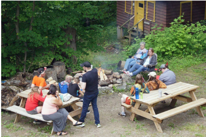
Camp Simpresca Campfire