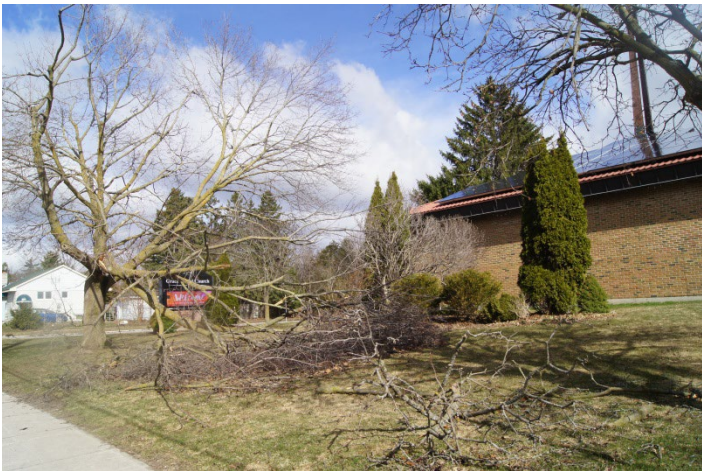
Debris from the Ice Storm