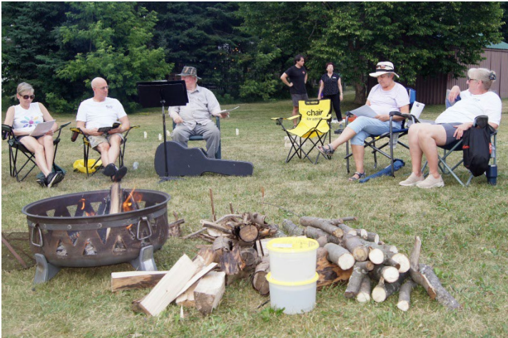
Campfire Evening in July