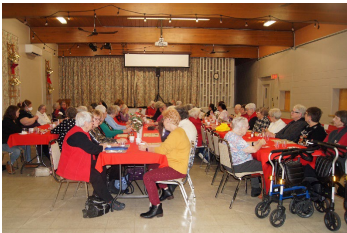
Ladies of Grace Chinese Food Dinner