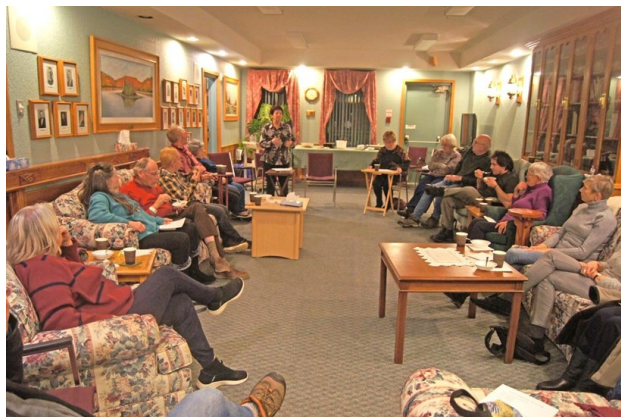
Church Council Meeting