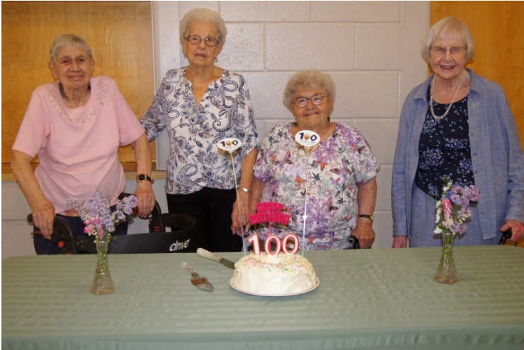
Our 90+ Year Guests at the Centennial Tea