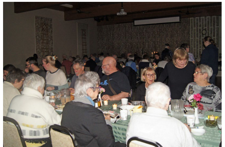
Dining by Candlelight at the Spring Dinner because of the ice storm