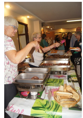
Welcome Back BBQ September 7, 2025