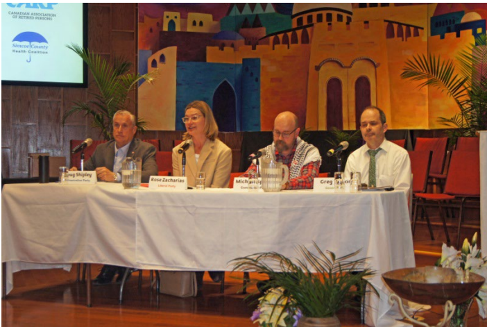
All Candidates Meeting/Forum