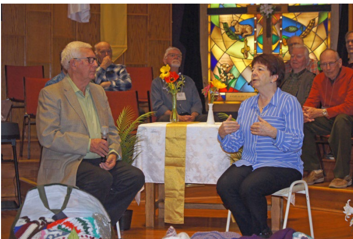
Christian Family Sunday