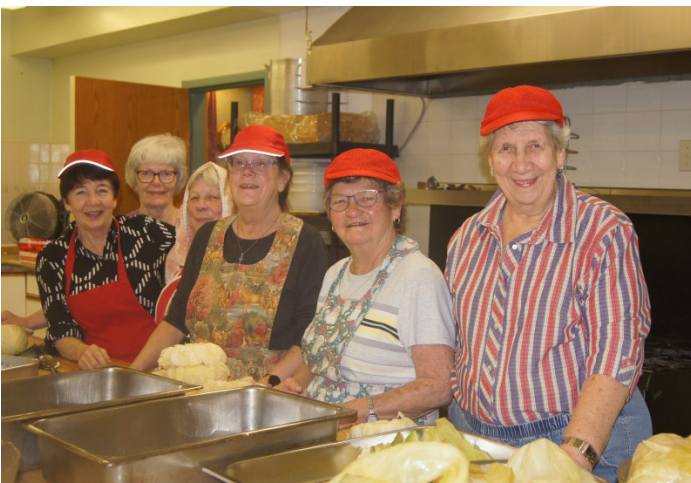
Making Cabbage Rolls for the Food Fair