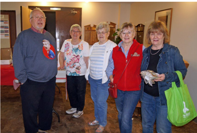
Getting Bargains at the Spring Bake Sale