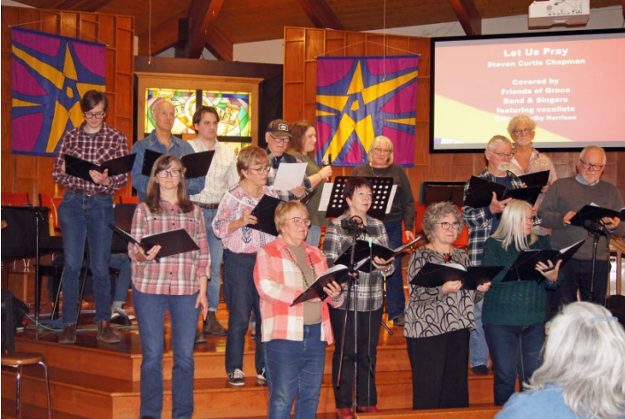
Not Your Grandparents' Hymns Concert