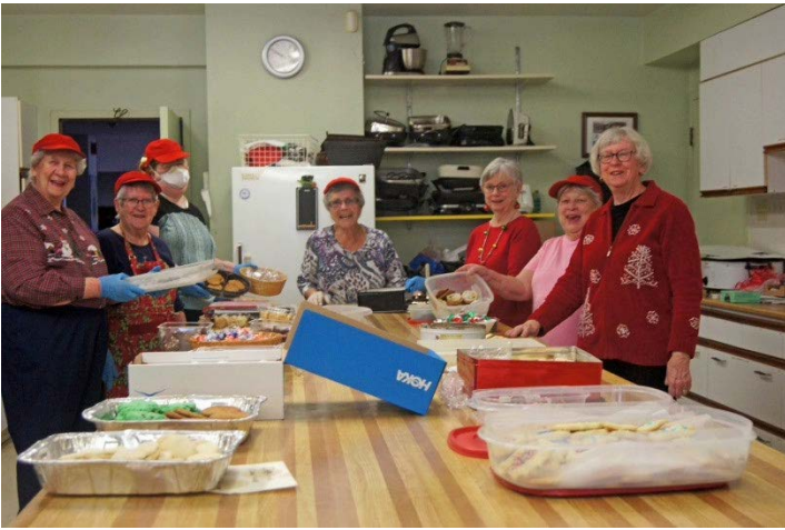
Preparing the Christmas Treat Boxes