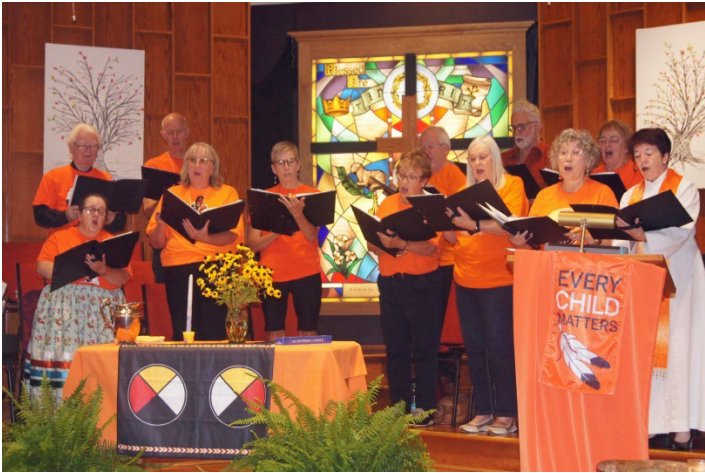
Orange Shirt Sunday