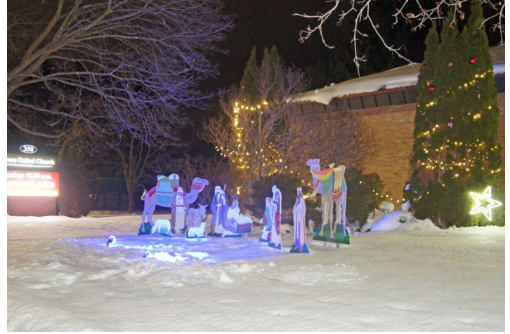
Nativity Scene on the Grace Lawn